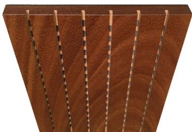
Dado™ 28/4 Panel