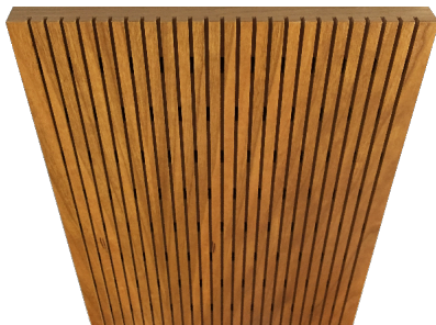
Dado™ 6/2 Panel