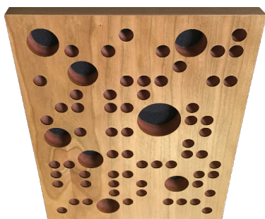
Expo™ Galaxy Panel