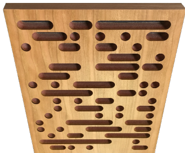
Expo™ Code Panel