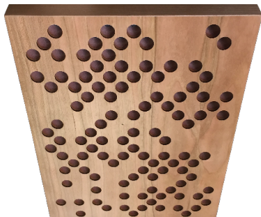
Expo™ 45 Panel